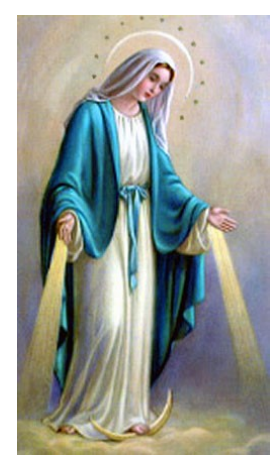
Our Lady of the Immaculate Conception Pray for us!

Our Blessed Mother Mary and the Advent Promise